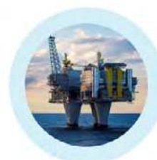
Fewer delayed campaigns by reducing sidetracks