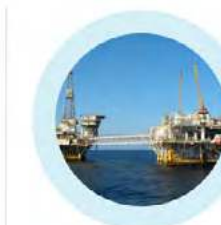
Efficient and safe drilling of CCS wells

Sekal contributes to fewer rig days, fewer supply runs and limits chance of adverse events: Rystad study indicates a ~17% reduction potential