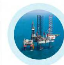
Lower probability of unwanted well events