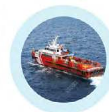
Reduced need of logistics services