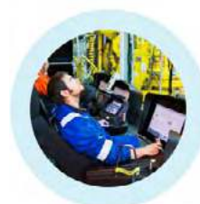
Faster drilling campaigns

Sekal solutions can save significant amounts of CO2 during drilling operations while also increasing personnel safety